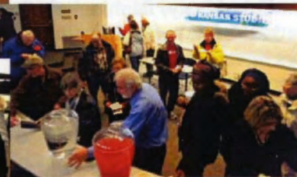
January 28, 2014