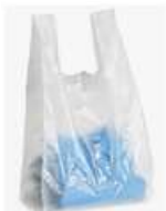
Plastic Grocery Bags