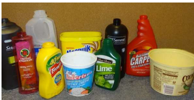
Plastic Bottles & Tubs ONLY Plastic #1 & #2