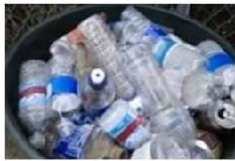
Plastic Water Bottles