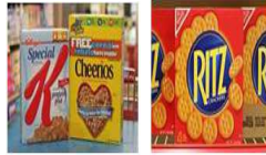
Cereal Type Boxes