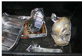
Food Contaminated Aluminum Foil