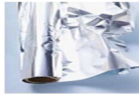
Clean Aluminum Foil