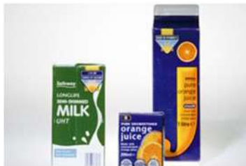
Wax Coated Milk Cartons and Juice Boxes

STOP, these items cannot be placed in your bin: