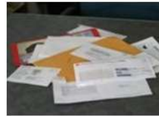
Junk Mail and Phone Books