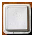
No Styrofoam of any Kind